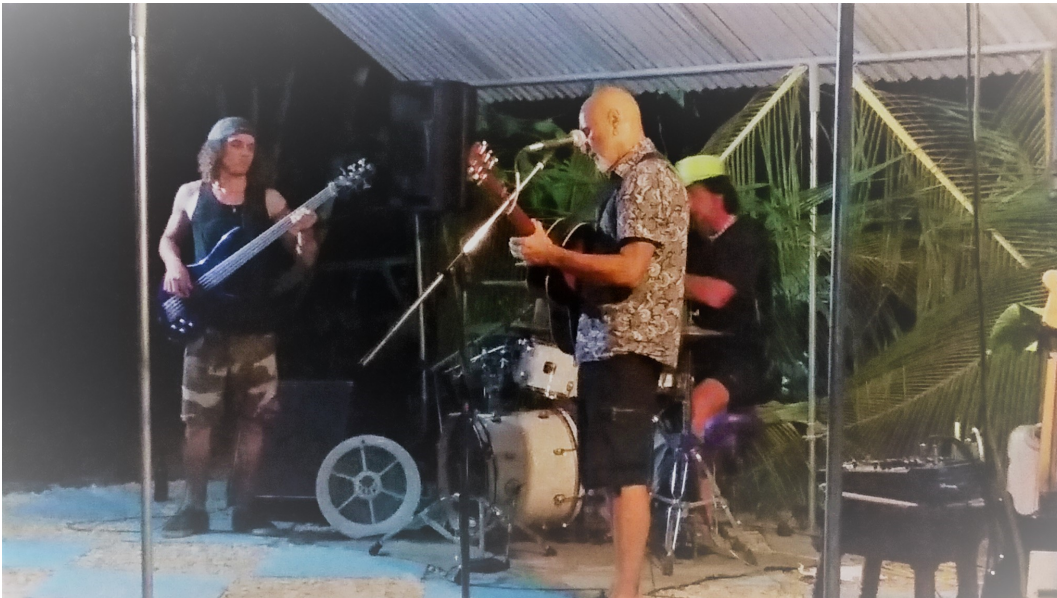
BLACK CAT BONE at Villa Leonor for Ballena Blues Series